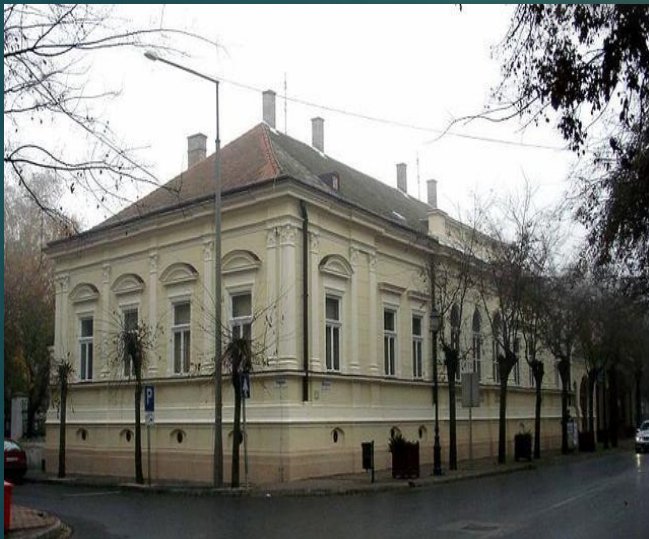
Thorma János Museum